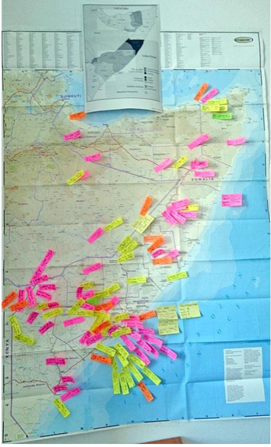
FIGURE 2 Regional risk assessment map

Open and semi-structured interviews with key stakeholders of both genders were conducted on five pre-assigned themes: identity, gender, livestock and livestock markets, borders and territories. Before conducting any interviews, permission was obtained from the regional president's office, which was then provided to officials at the zone, woreda and kebele levels, the gatekeepers to local communities. Woreda selection criteria included locality security and government permission, as well as rain-fed and river-fed farms, areas within and without government sedentarisation programmes and weather constraints. The likelihood of resident attendance was an important consideration as the growing pressure of drought, described by authorities as more severe than that of 1983–1985, reportedly caused significant migration in search of water and pastures. Results were cross-referenced at several points throughout the research process using expert and group interviews with elders, respected community members and government and non-government officials.